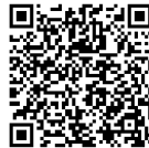
Church Retreat Sign-Up